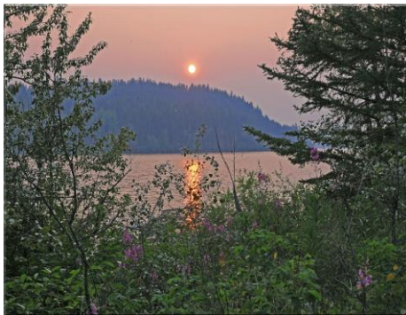
"End of Summer"